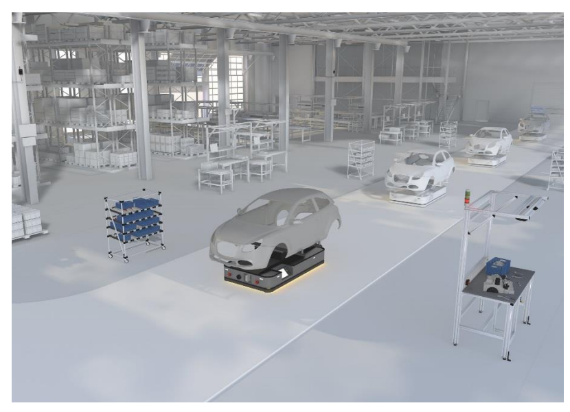
Fig. 1: The future of intralogistics is flexible and requires wireless communication networks

When selecting wireless networks for their industrial production, many factory planners favour open rather than proprietary networks. However: this apparent contradiction begins to blur, the closer one looks. A comparison of the two systems shows why.