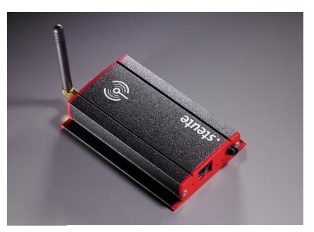
Fig. 3: Access Points bundle sensor signals in the field

Fig. 2: In one sWave.NET network, several hundred – and in practice to date up to 2,000 – sensors can be integrated